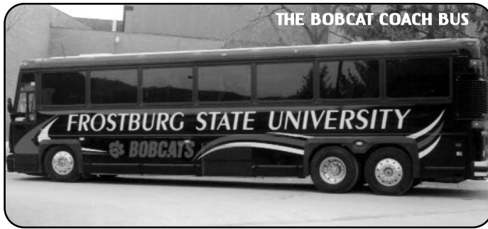
THE BOBCAT COACH BUS